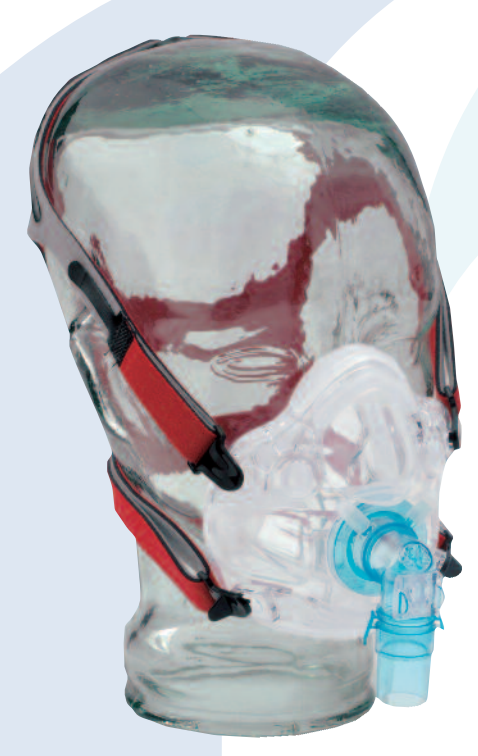
V2 Full Face CPAP Mask, Large (113485)